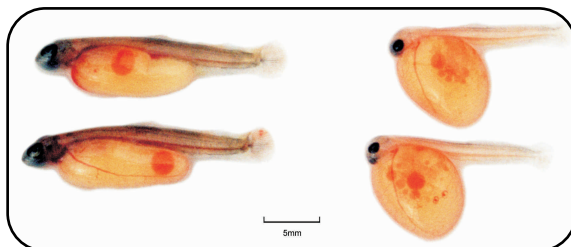
Plate 1. These alevins are the same age and share the same parents. The pair on the right developed in hyporheic water of low oxygen content. Those on the left developed in surface water of good quality.

At sites where there was a strong influence of groundwater, salmon egg survival was low. At sites dominated by surface water, or at sites with intermediate characteristics, egg survival was generally good. Even here, however, a range