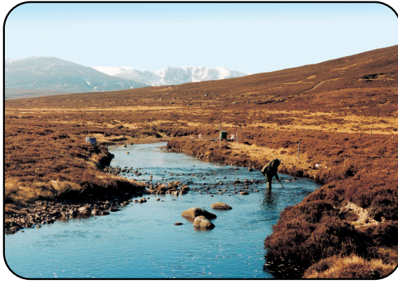
Hyporheic water sampling in a groundwater dominated spawning reach of the Gironck Burn, Aberdeenshire.