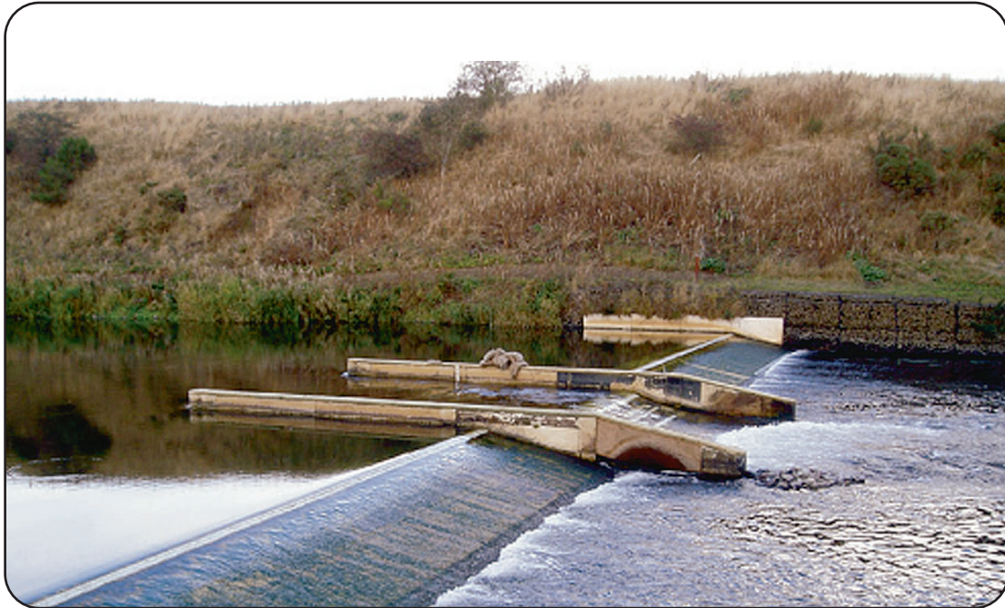
The automatic salmon counter at Logie on the River North Esk