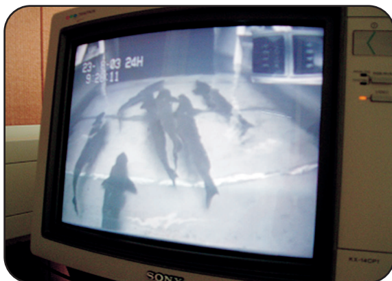
Several salmon pass a counter together triggering just a single count

The study demonstrates that automatic counters can provide good local information about long-term changes in the abundance of Atlantic salmon. Automatic counters are expensive to install and despite their name require substantial maintenance. Consequently, the use of counters to monitor all of Scotland's salmon populations is impractical.